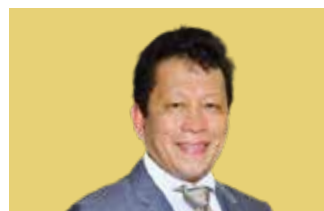
RTN Democrito Diamante