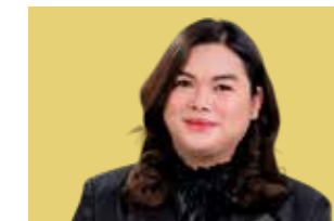
Past DRR Griffins Malazarte